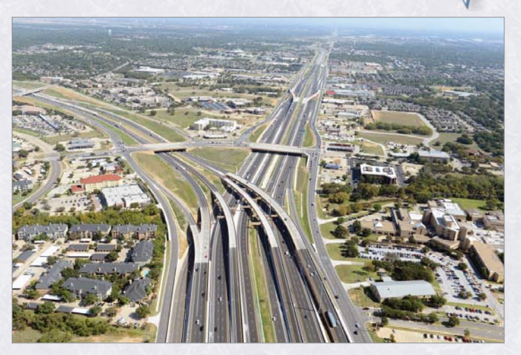
Pictured above: North Tarrant Express

The North Tarrant Express (NTE) rebuild some of northeast Tarrant County's most congested highways. Construction started in late 2010 and completed in October 2014 -- nine months ahead of schedule. The project was designed and built concurrently by NTE Mobility Partners (NTEMP) and Bluebonnet Contractors (BBC), shaving several years from the project schedule. Completed, the project provides eight to 10 lanes on Interstate 820 (I-820) and State Highways (SH) 121 and 183. The project improves mobility by almost doubling the existing road capacity with a combination of general highway lanes and continuous frontage roads, along with managed toll (TEXpress) lanes that use dynamic pricing to keep traffic moving at 50 mph. As the first comprehensive development agreement (CDA) project signed in North Texas, the NTE has leveraged a $573 million TxDOT investment into a $2.5 billion infrastructure redevelopment project that reaches from north Fort Worth to near DFW Airport.