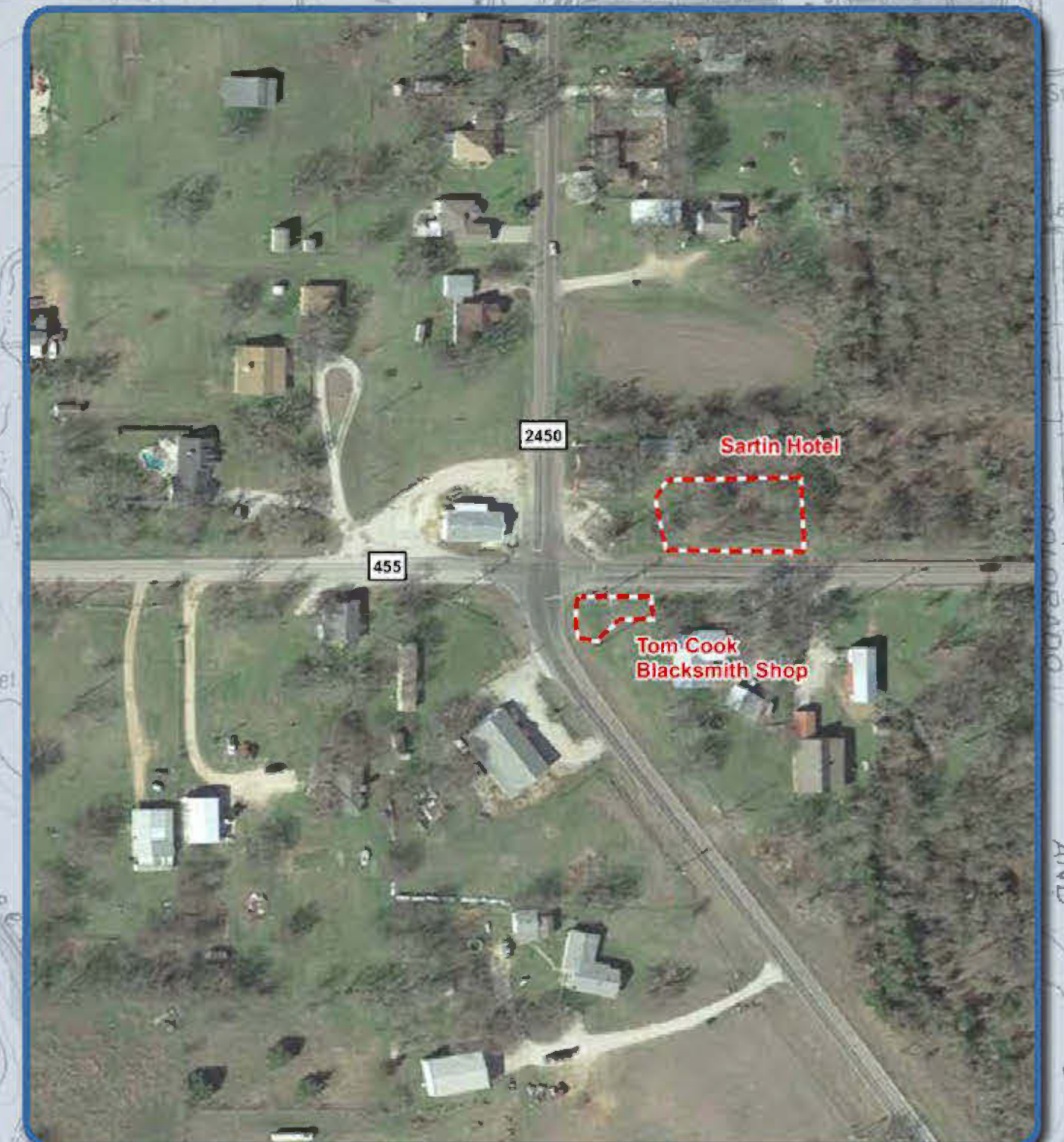
The two archeological sites (in red) are located at the main intersection in Bolivar, where FM 455 and FM 2450 cross. Now farm-to-market roads maintained by TxDOT, in the late nineteenth century these were wagon and stagecoach roads. Many Texas highways closely follow the paths of historic roads.

The project involves archeology, archival research, descendant community outreach, and oral history research. The Bolivar Archeological Project is breaking new ground revealing untold stories that you will not find in any history book.